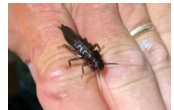
What it's all about - Linn Run Brook Trout and stonefly.