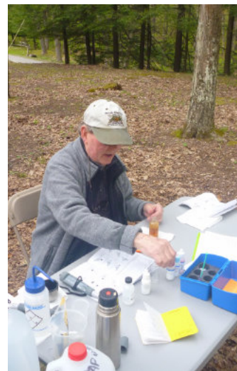
Testing for dissolved oxygen.

The next step involved the teams collecting water samples throughout the watershed and bringing them back to our on-site “lab” at the Grove Run Picnic Area where the samples were evaluated for pH, alkalinity and dissolved oxygen among other parameters. Samples from key sites were further tested by Dr. Daryle Fish at Saint Vincent College.