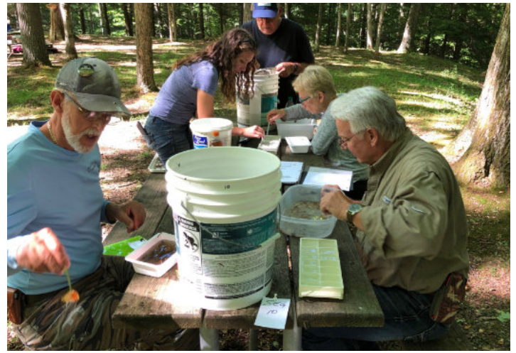
Macroinvertebrate counting and sorting.