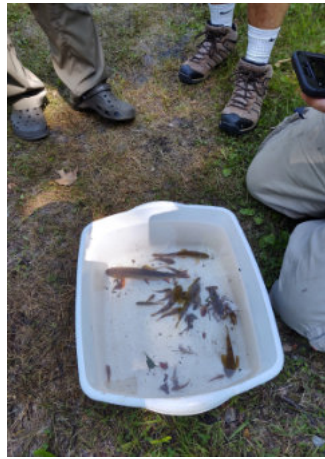
Electro-fishing and the results. brook trout, sculpins and crayfish.

A few native brook trout along with sculpins and crayfish turned up in the electro-fishing survey while mayflies, stoneflies and caddis were revealed in the kick net study.