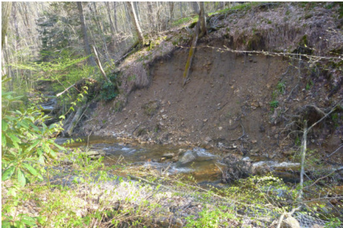
Badly eroded bank on upper Linn Run noted in the visual assessment.