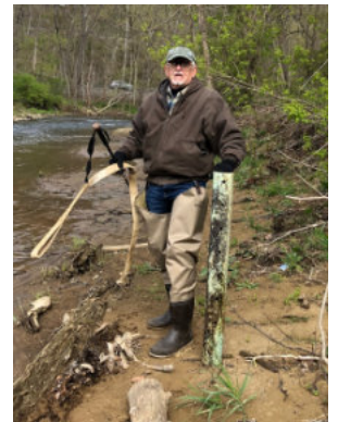
Latrobe crew at Mission Road and removing junk from the DHALO area.