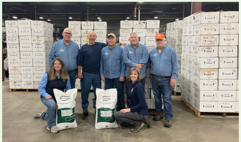
FTTU volunteers with trout food ready to ship out to PA schools

On January 8th, 2025, five FTTU volunteers traveled up to the Benner Springs fish hatchery near State College to help pack and ship trout food out to Trout-in-the-Classroom Schools all across Pennsylvania. Did you know our state has the largest TIC program in the nation with 460 participating classrooms? Look at all those boxes! One week later, FTTU volunteers returned to Benner Springs Hatchery to assist with packing the fish eggs. That's right, live trout eggs are packed in ice and shipped out to over 400 schools across Pennsylvania. Our guys have plenty of experience with this having helped out for several years now.