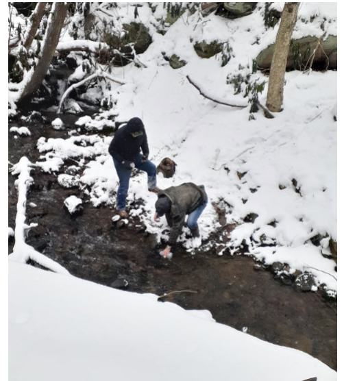
"Neither rain nor snow..." Monitoring of Rock Run in the bitter cold of January 2025