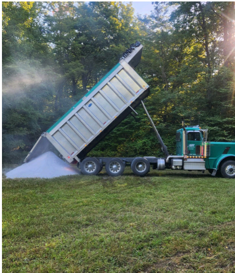
Limestone sand dropped off in the headwaters of Rock Run

If you find these white masses on a hemlock tree branch and it crumbles easily between the fingers, it is old and dormant, if it is soft and spreads with a light orange hue it may still be active.