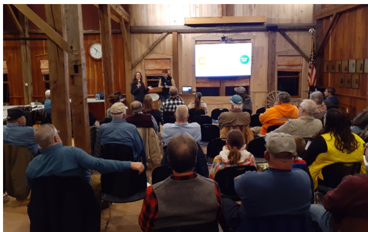
A full house at the J. Roy Houson Conservation Center in Greensburg

FTTU's March meeting at the Westmoreland Conservation District's Barn in Greensburg featured presenters from Carnegie Museum of Natural History (CMNH) and Powdermill Nature Reserve (PNR) who shared recently completed research findings and facilitated a discussion on how climate change is impacting our lives, and of particular importance to Trout Unlimited (TU), and our coldwater fisheries.