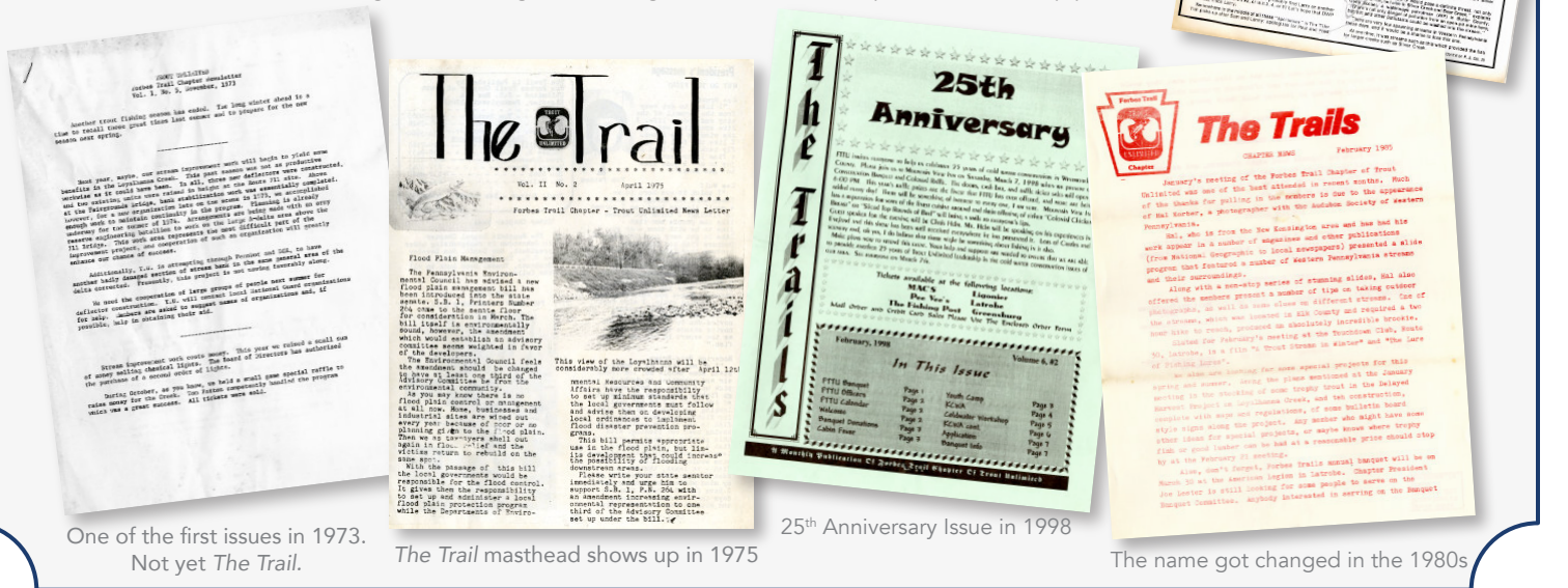
One of the first issues in 1973. Not yet The Trail .