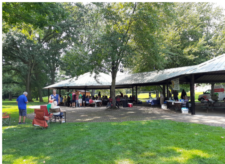
The Timken Plaza Pavilion at Latrobe's Legion Keener Park made a great location for this year's picnic