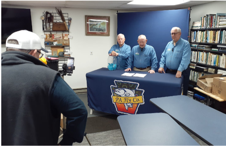
Lights, Camera, Action! Winning numbers are drawn live on Facebook

The chapter cleared a profit of $5,268.18 and shared $700.00 of our profits with the Westmoreland Food Bank.