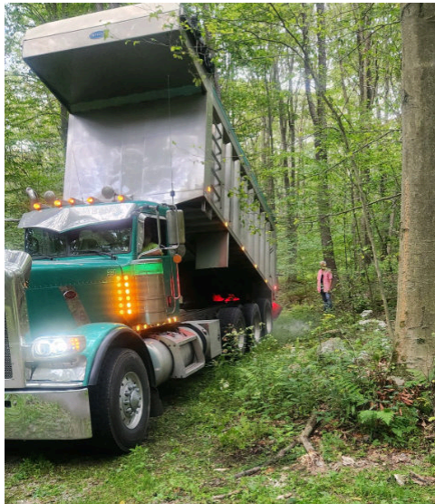
Limestone delivery to the headwaters of Linn Run